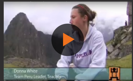
Watch a film one group of students helped make

Copenhagen International School raised funds to build and help run Mama Cocha centre in the North of Peru and have been fund raising and sending groups to us for over 12 years! The 'ambassadors' that come to Peru to see the projects progress report back to the school through blogs, videos and social media.